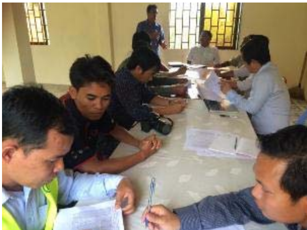
Meeting at Koh Toch commune