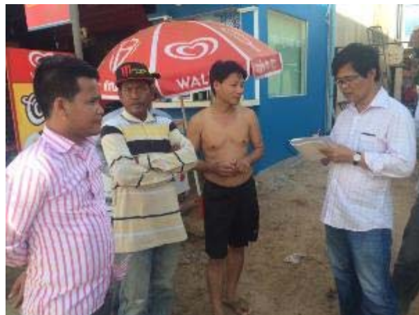
Interview people along the road