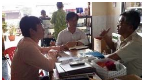
Discussion with commune Chief – Da market