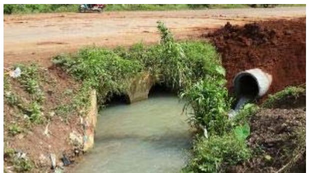
Cross drainage PK206-Flooded road