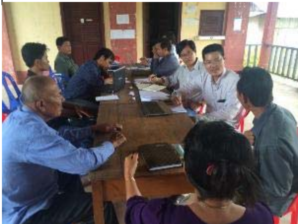
Meeting at Boeung Touk commune