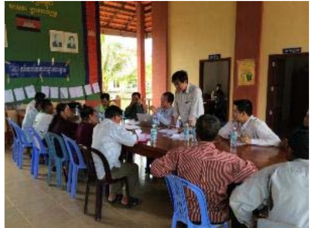
Meeting at Andong Khmer district