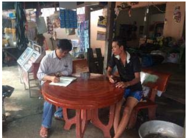
Interview local people