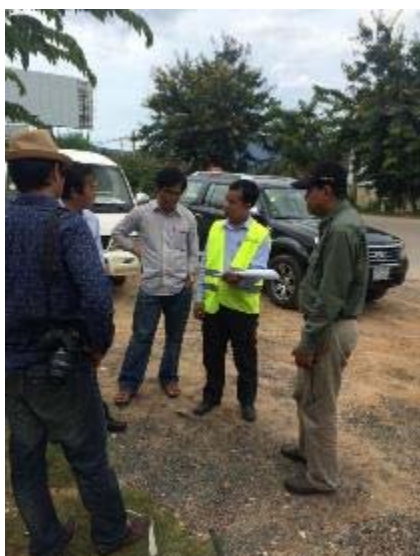
Discussion of existing pipe clean up