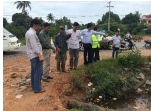
Visit side drainage-flooded area