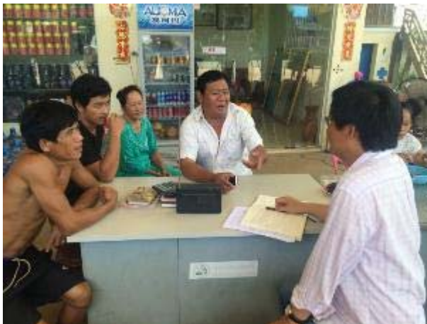
Business disruption discussion