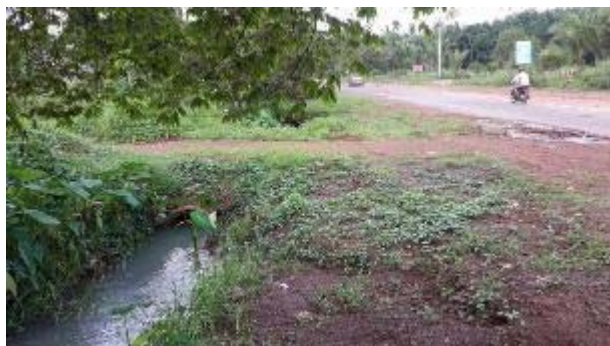
Existing small drainage to be enlarged