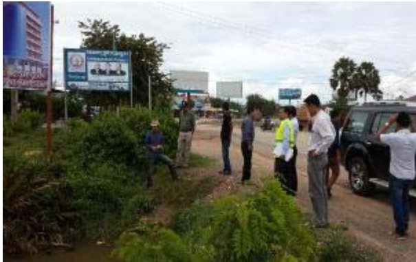
NR3 – Drainage outlet visit

Package 1-National Road No.3 (PK147+000 – PK201+000)