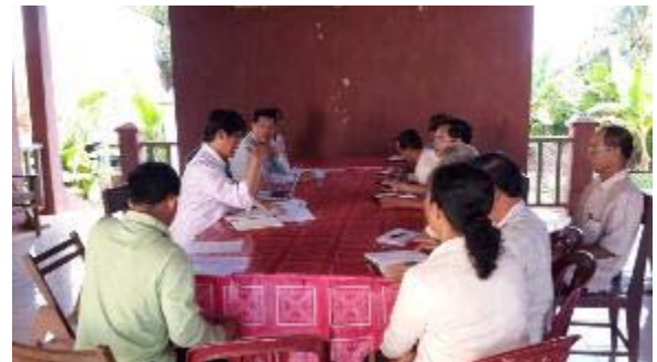
Discussion with local authority-Memot