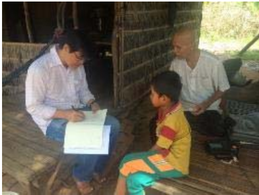
NR7- Interview with local resident