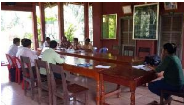
Discussion with local authority-Snuol