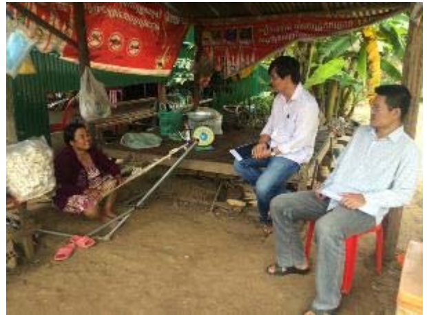
NR7- Interview with local resident