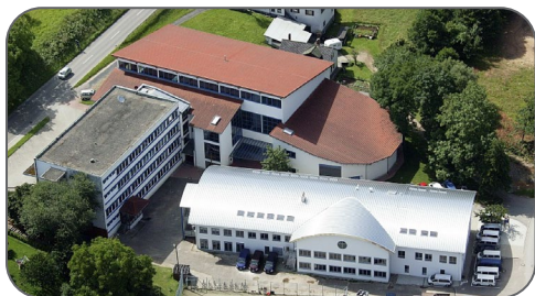
Black Forest Academy, Germany

As we continued to be willing to go where He wanted us to go and to do what He wanted us to do, God led us to Black Forest Academy in Germany. The Christian and Missionary Alliance (C&MA) had decided to pass on the ownership of Dalat School to the parents as a private international school in Penang, Malaysia. Therefore,