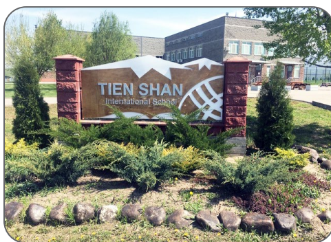
Tien Shan International School, Central Asia

I had the privilege of establishing partnerships with different organizations to use transformational education services to bring the next generation of students and the current generation of teachers to Christ. What a joy and privilege to be part of this amazing journey with so many colleagues and like-minded educators to reach the world for Christ.