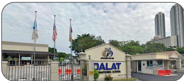
Dalat International School, Malaysia